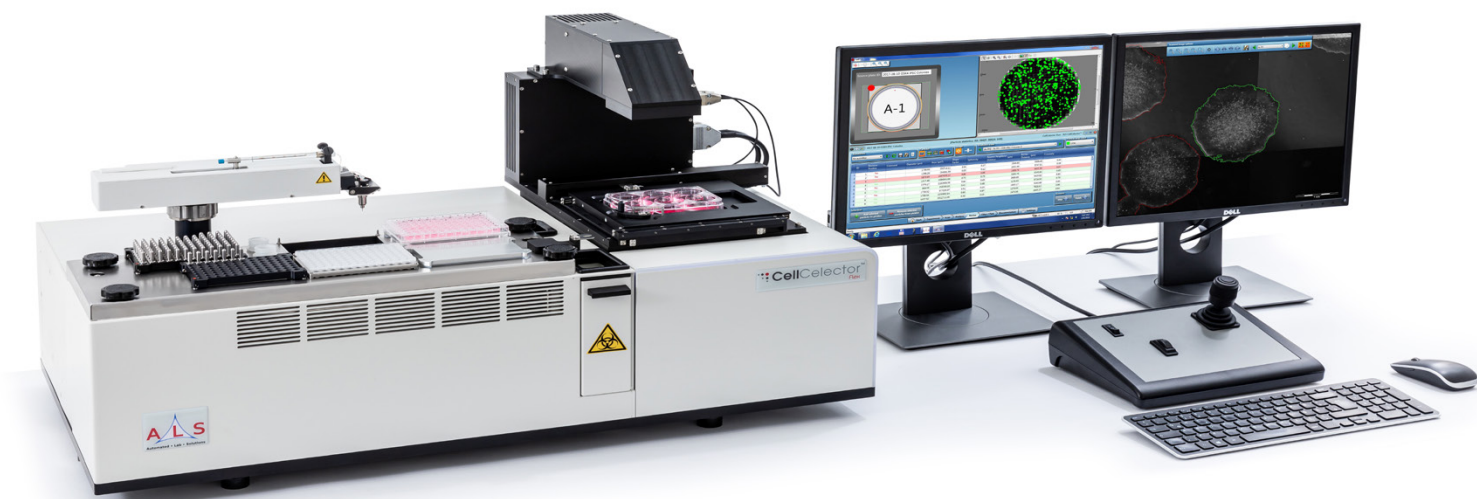
Figure 1: A typical CellCelector set-up, with the main unit in a biosafety cabinet, and the workstation placed to the side.